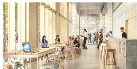
IPHE Paris-Saclay, Saclay