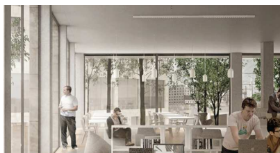
Îlot Fertile, Paris

Offices open to the outside world, sharing of resources and services with other users, open and interoperable systems and equipment to facilitate operation of the building and services, provision for the reversibility of spaces, etc.