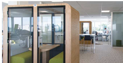
Parc Actif, Lormont