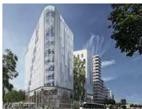
Chapelle International, Paris